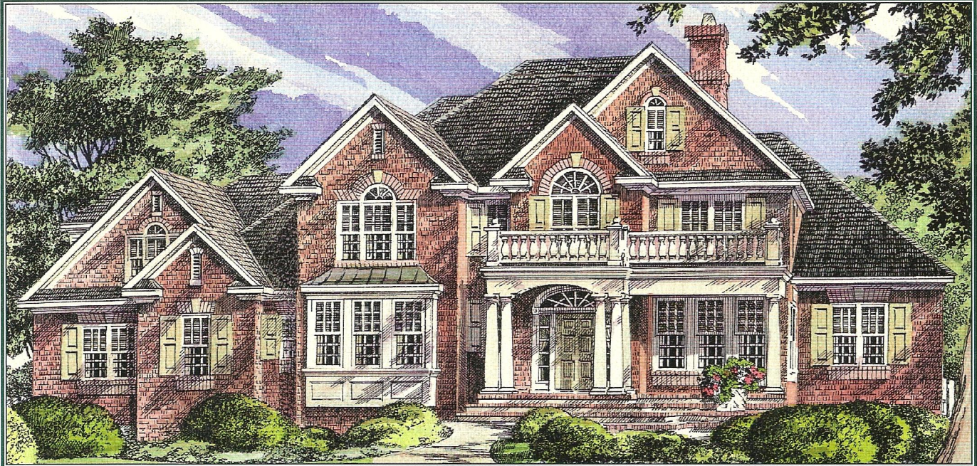
© 2003 Donald A. Gardner, Inc.